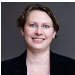
Allen and Koe PLLC Member Since 2011

Report your news here. Click here to check The Wire's news reporting guidelines.