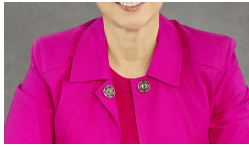
SLP Consulting LLC Ambassador Committee Chair Member Since 2013